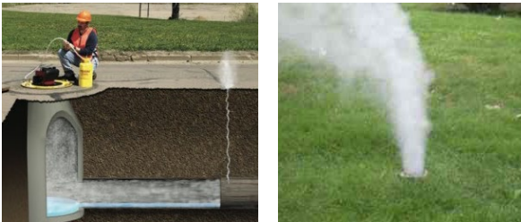
Example of sewer smoke testing

Currituck County will be smoke testing the collection system by Spring 2019 to find sources of I&I. This common, non-toxic test will allow the County to identify problem areas in the system to repair or replace. Additional information will be sent out prior to testing. Residents should take this time to fix any known problems on their property that can contribute to I&I (e.g. broken plumbing, missing cleanout cap). Homeowners found with any deliberate source contributing to I&I may be fined.