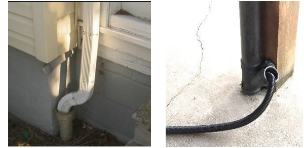
Examples of Infow sources

Infiltration is water that enters into the sanitary sewer system from below-ground sources (e.g. groundwater). Sources include: