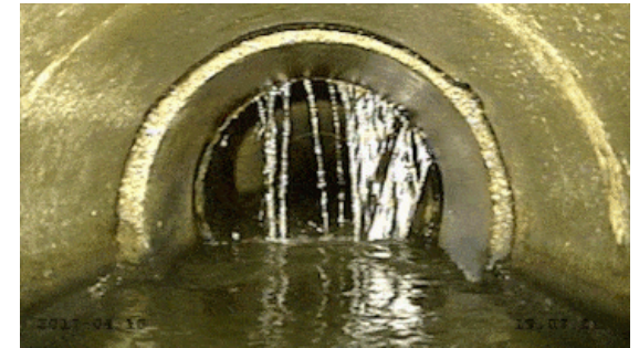
Example of Infiltration source - Inside view of water coming into sanitary sewer pipe