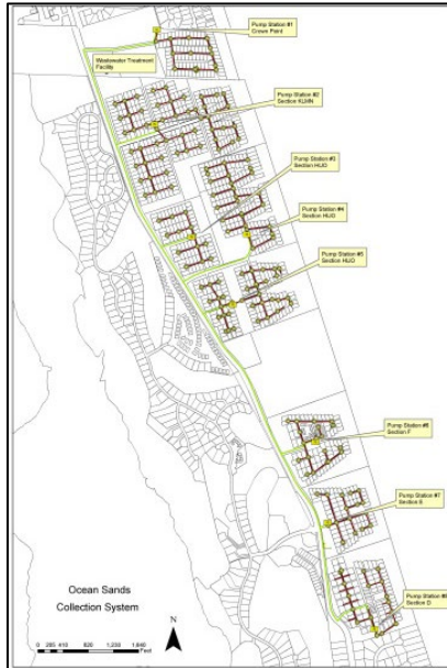
Layout of collection system in Ocean Sands

Over 7 miles of underground piping and 8 lift stations make up the Ocean Sands wastewater collection system. Wastewater from homes flow through these pipes by gravity to a pump station. The pump station then pumps it to the wastewater treatment plant where it gets treated and disposed. Currituck County is responsible for the operation and maintenance of the collection system up to the homeowner's property line .