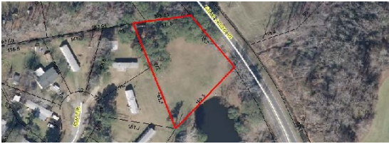
^ Wedgewood Lakes Lot