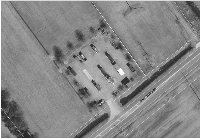
SHAWBORO CONVENIENT SITE 426 SHAWBORO RD SHAWBORO, NC