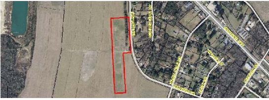
^ Newtown Sewer District Operation Site