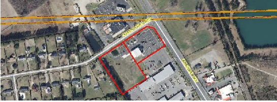
^ Moyock Welcome Center