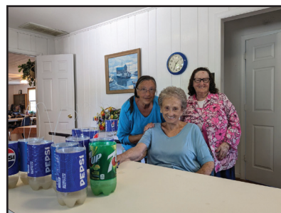
Seniors at Knotts Island made unique bird feeders during a summer workshop.