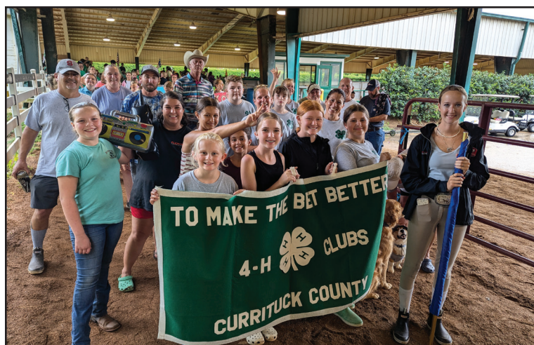
Left: Currituck County delegates participated at the NC State 4-H Horse Show.