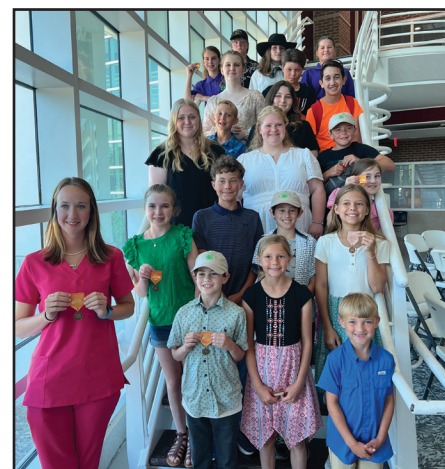
Right: Currituck County had many youth members deliver 4-H presentations.