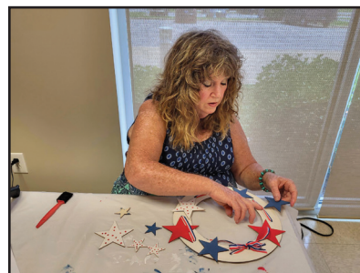
Seniors created July 4th crafts at the Currituck Senior Center.