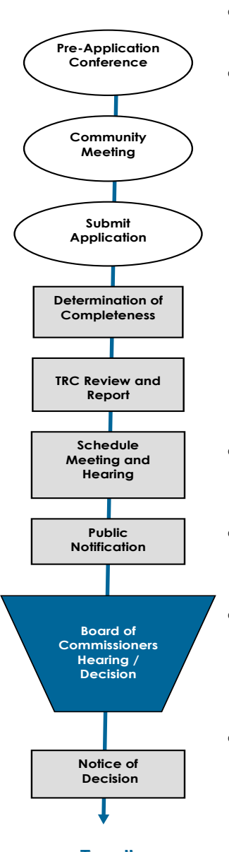
Type II Preliminary Plat /Special Use Permit

The community meeting shall comply with the following procedures: