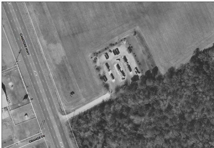
GRANDY CONVENIENT CENTER 6815 CARATOKE HWY GRANDY, NC