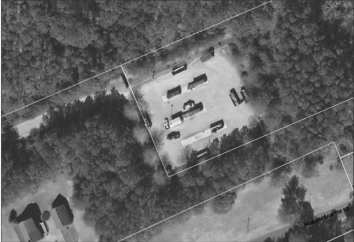
SPOT CONVENIENT SITE 309 N SPOT RD POWELLS POINT, NC