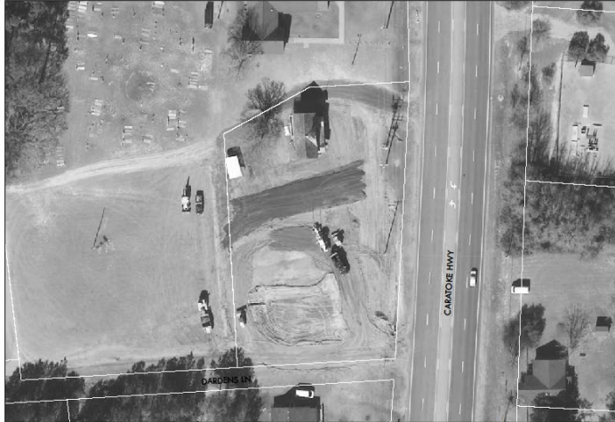
JARVISBURG COLORED SCHOOL 7302 CARATOKE HWY JARVISBURG, NC