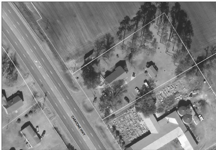
POWELLS POINT SENIOR/COMMUNITY BLDG 8011 CARATOKE HWY POWELLS POINT, NC