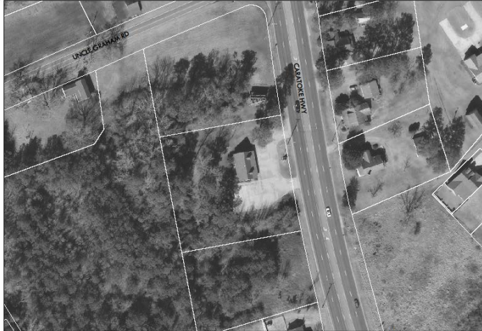
GRANDY OFFICE BUILDING 6644 CARATOKE HWY GRANDY, NC