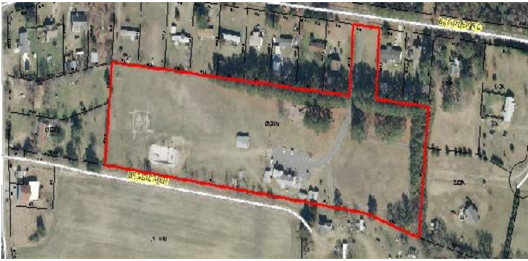
^ Senior Center-Ruritan Club, 126 Brumley Rd, Knotts Island, NC