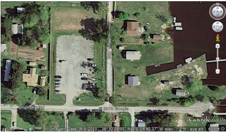
^Brumley Road Boat Parking Area, Knotts Island, NC