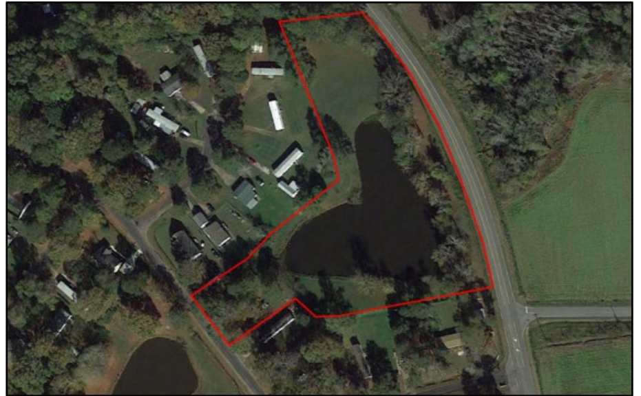
WEDGEWOOD LAKES LOT -