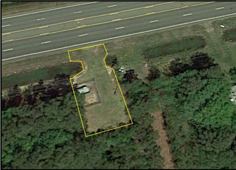
SLIGO BOOST STATION – 2480 CARATOKE HIGHWAY