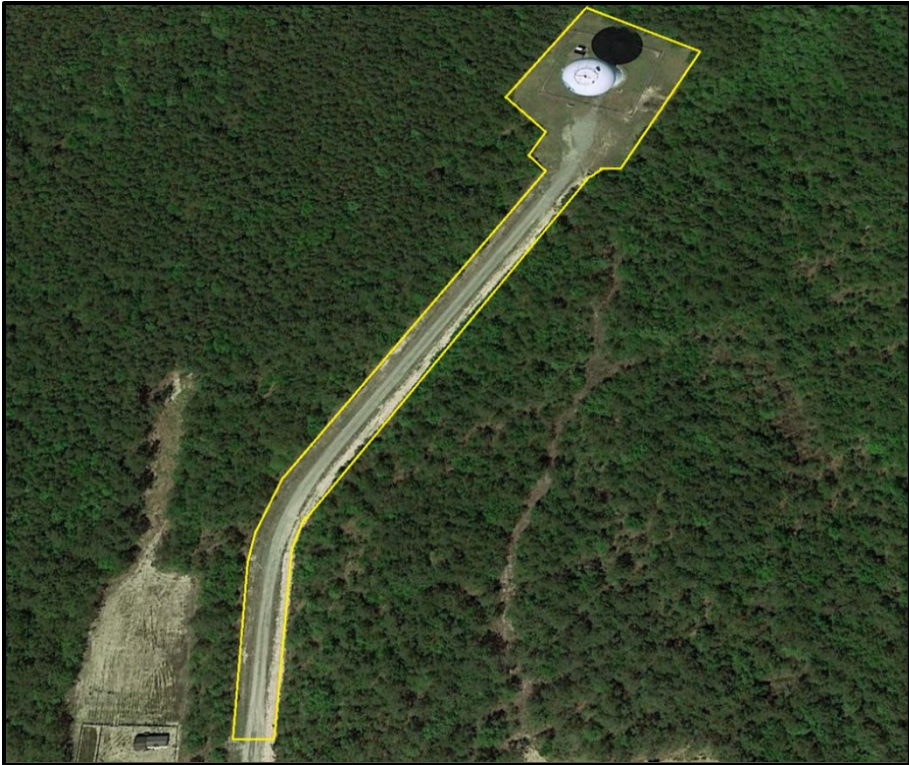
HIGH COTTON WATER TOWER AND ACCESS ROAD -