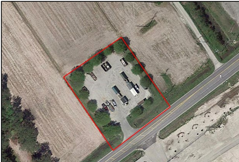
SHAWBORO CONVENIENCE SITE – 426 SHAWBORO ROAD