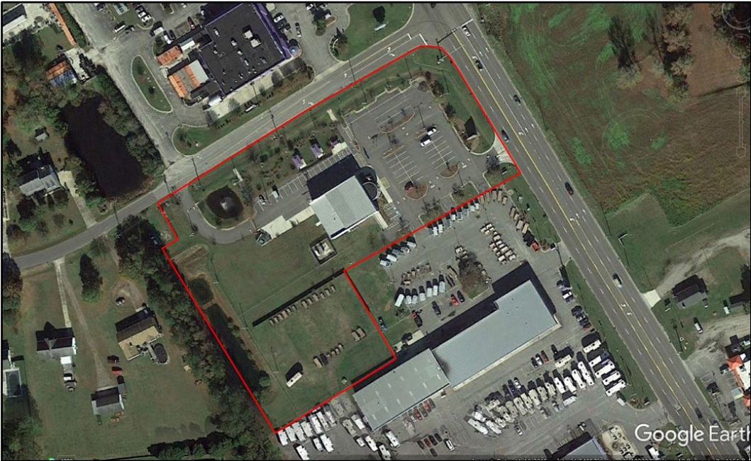
MOYOCK WELCOME CENTER – 106 CARATOKE HIGHWAY