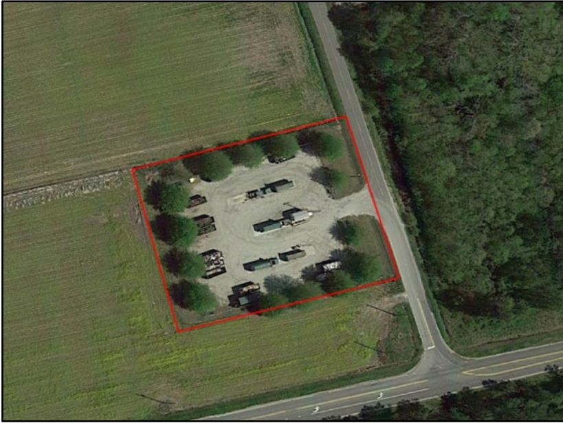
MOYOCK CONVENIENCE SITE – 101 PANTHER LANDING ROAD