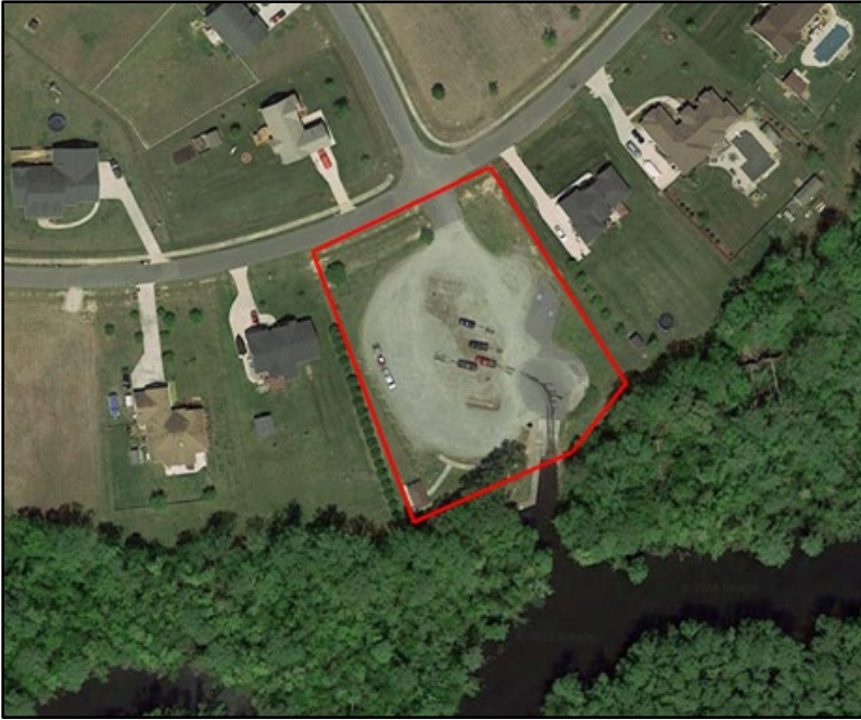
SHINGLE LANDING BOAT RAMP – 129 CREEKSIDE DRIVE