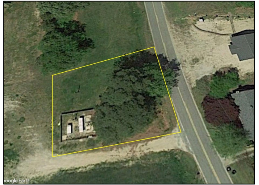
NEWTOWN ROAD SEWER -